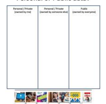
Figure 4: An example of sorting activity for deciding whether data is personal (owned by students), personal (owned by someone else) or public (owned by everyone)