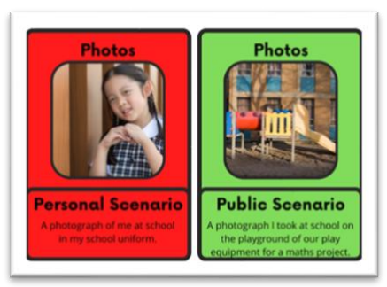
Figure 2: An example of a sorting activity for deciding whether an example of the same data, e.g. photos, could be classified as personal or public depending on the