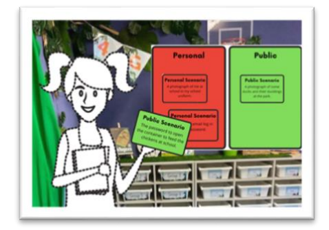
Figure 1: An example of a sorting activity for deciding whether data in each scenario is personal (owned by students) or not personal (owned by someone else or everyone)