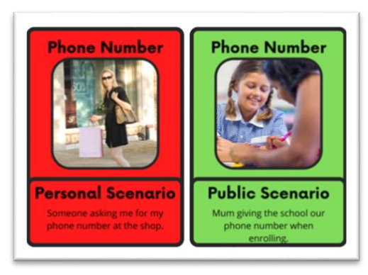
Figures 5 and 6: An example of a turn up, turn down card game where students decide in each photo scenario if the data is personal or public