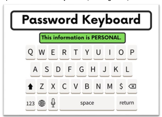
Figure 7: An example of a laminated keyboard that encourages students to practise typing (and remembering) their passwords