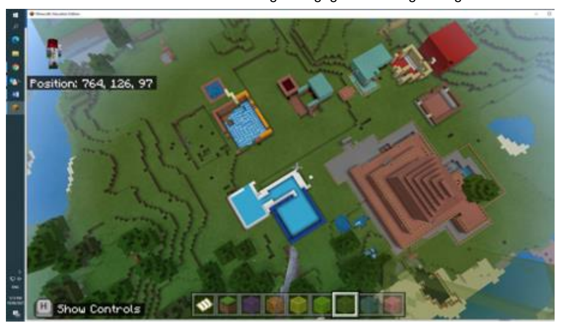
Figure 3: An example of the Minecraft learning environment

One teacher developed an 'escape room' challenge in students' first language using Minecraft. The introduction of Minecraft was credited with improvements in student confidence and resilience across the school. There was also evidence of development of stronger peer-to-peer relationships with improving communications and problem-solving skills. Girls were observed to be more willing to engage in learning through Minecraft.